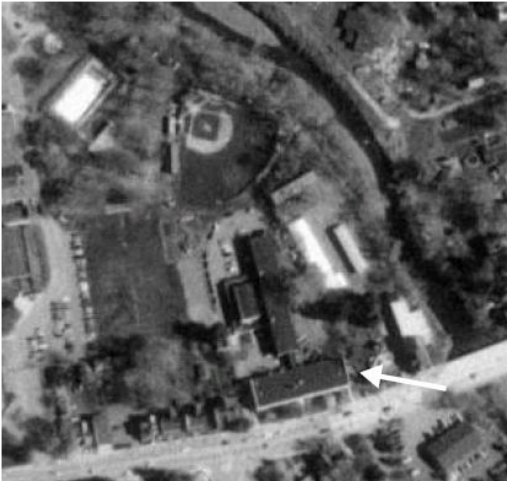
Aerial View of B. F. Morey Elementary School

2001 Stroudsburg, PA-NJ Quadrangle . Topography compiled 1999. Planimetry derived from imagery taken 1999 and other sources. Survey control current as of 1955. Boundaries current as of 2001. Denver, CO.